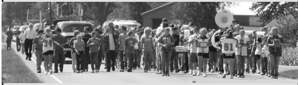
Below: The Mustang Student Body marches to the football field on Homecoming day led by the Mustang Marching Band

mores were deemed the winners of the float competition with their rendition of an old-west Mustang fort.